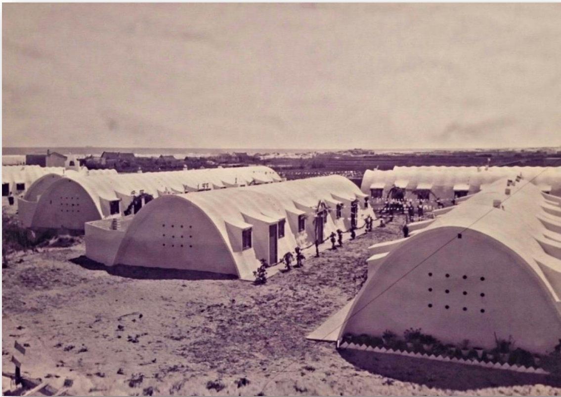
PHOTO 3. Original appearance of the houses in the 1960s.