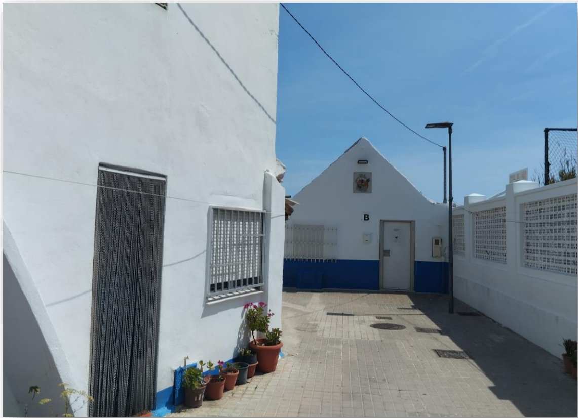
PHOTO 9. Barrack, current headquarters of the Perellonet falla