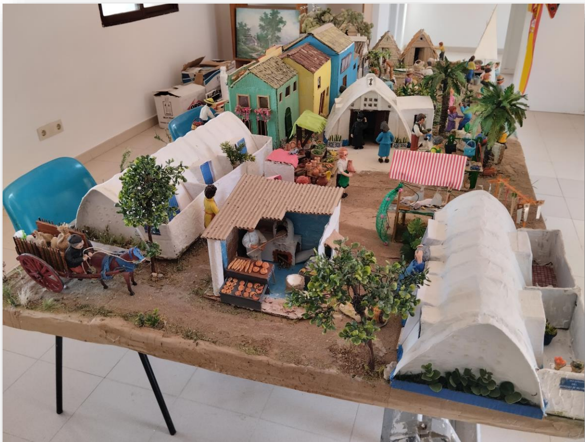
PHOTO 10. Recreation of the old village of El Perellonet. Civic center (former schools)