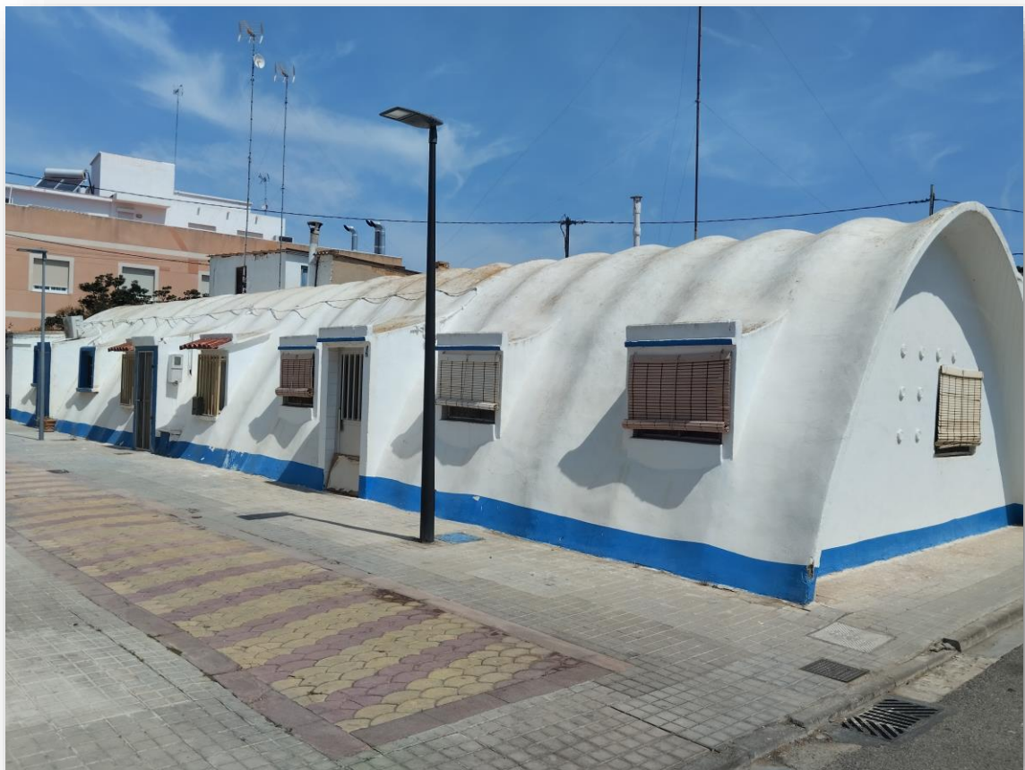
PHOTO 1 and 2. Group of Fishermen of Marqués de Vallterra today.