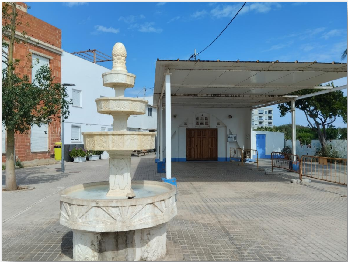
PHOTO 5 and 6. Church of the Virgin of Carmen