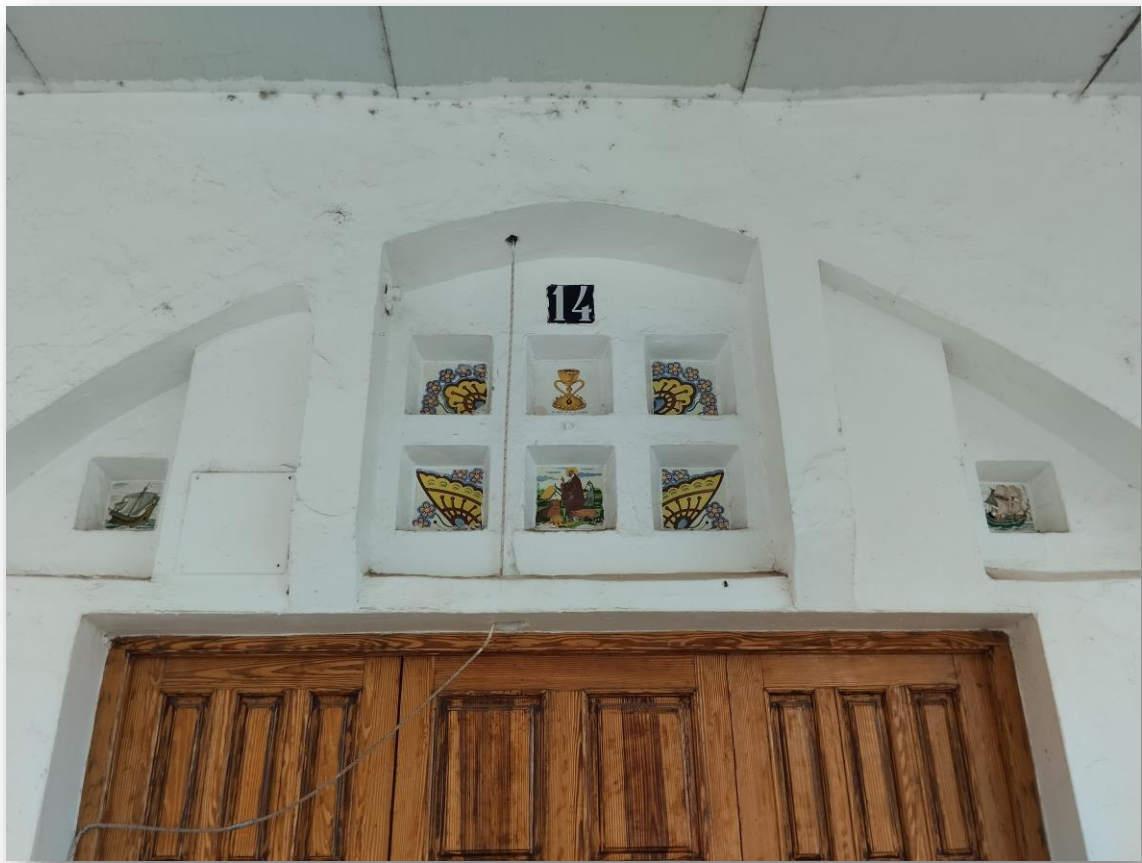
PHOTO 7. Detail of the entrance arch of the church