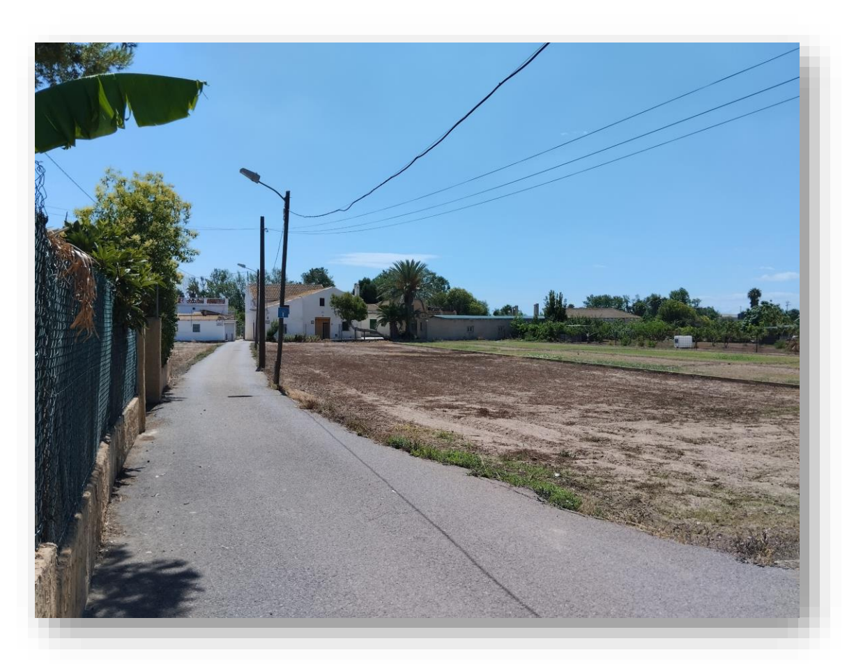
PHOTO 4 and 5. Hermitage of El Fiscal and the surrounding huerta landscape