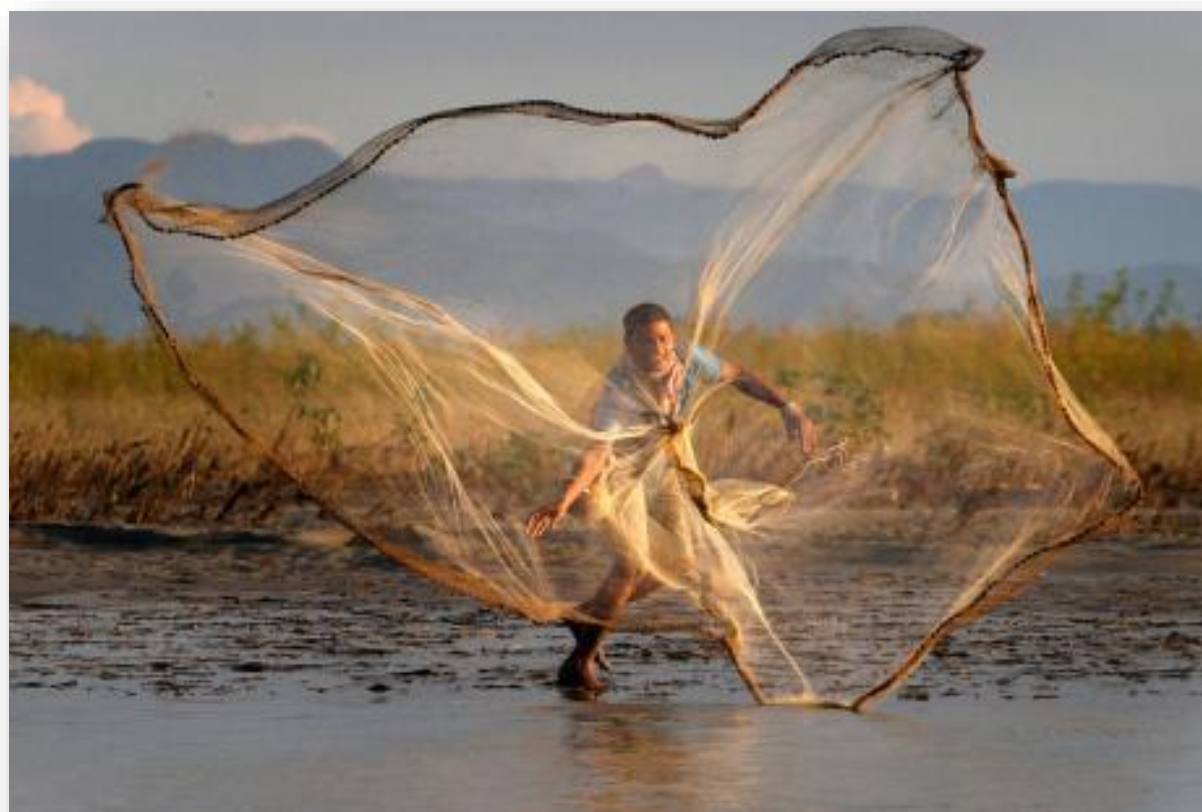
PHOTO 7 and 8. Rall fishing