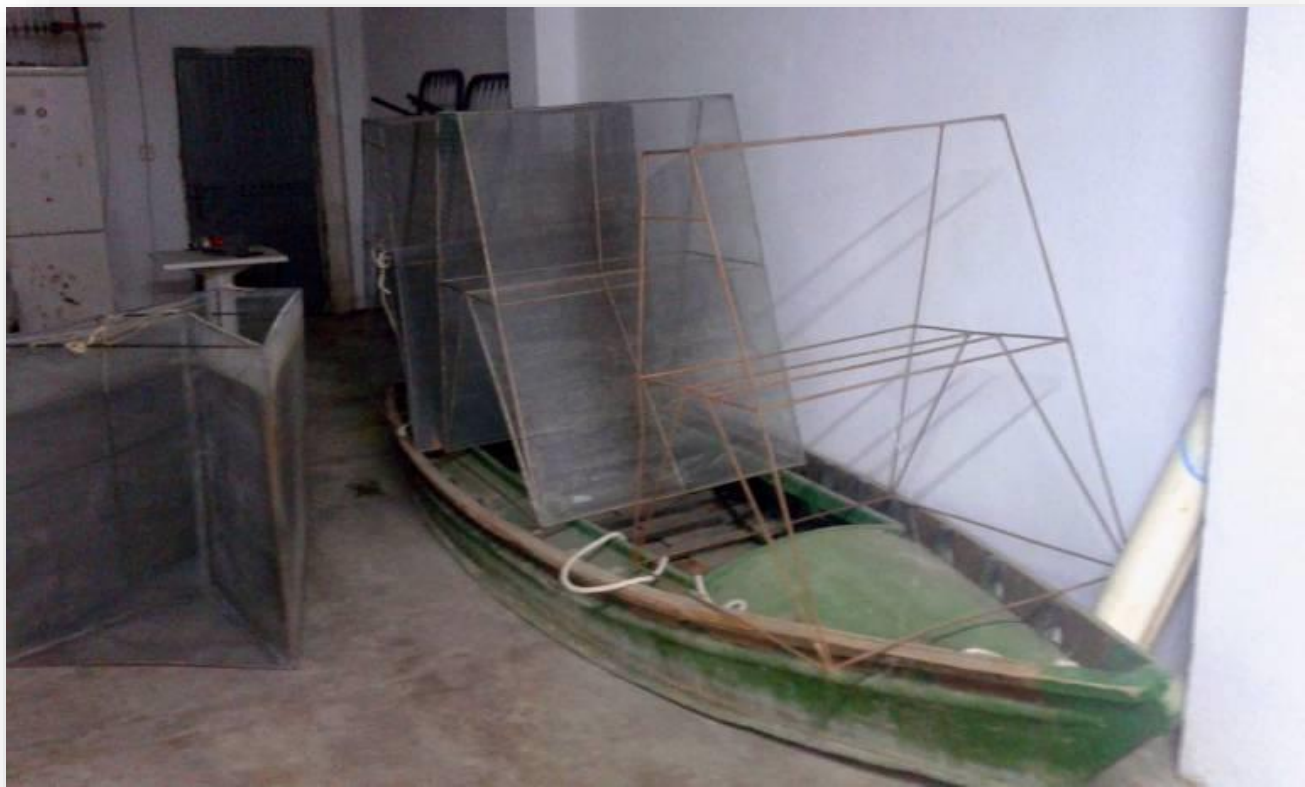
PHOTO 5 and 6: Monots for eel fishing