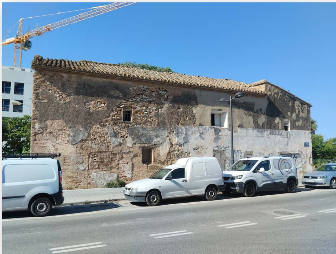
PHOTO 1 and 2. The Alquería de Pastor