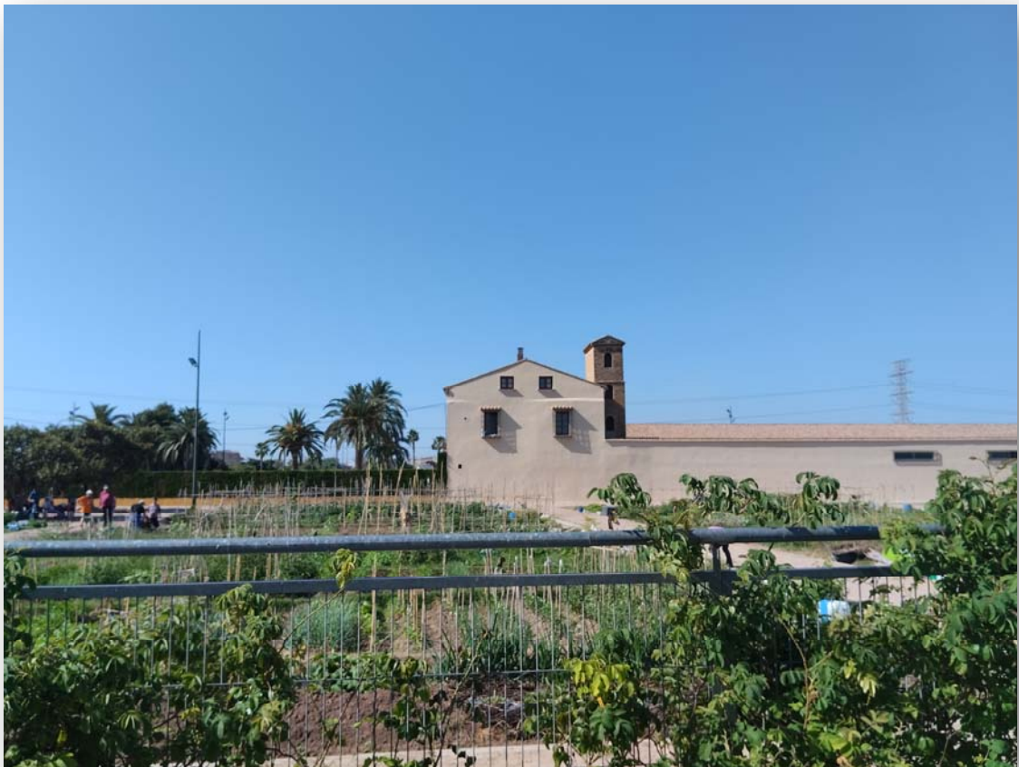
PHOTO 3 and 4. Alquería del Saboner, next to the urban orchards of Sociópolis.