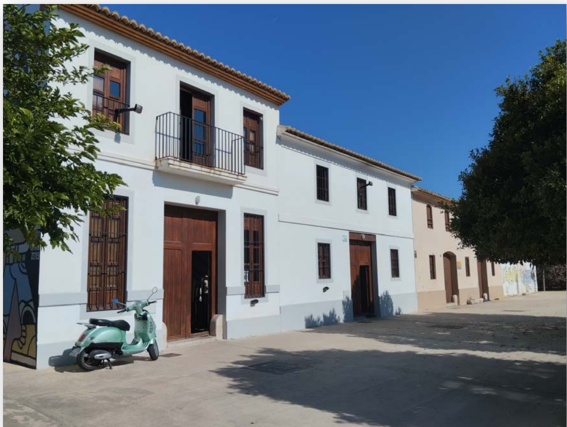
PHOTOS 5 and 6. The Alquería de Coca