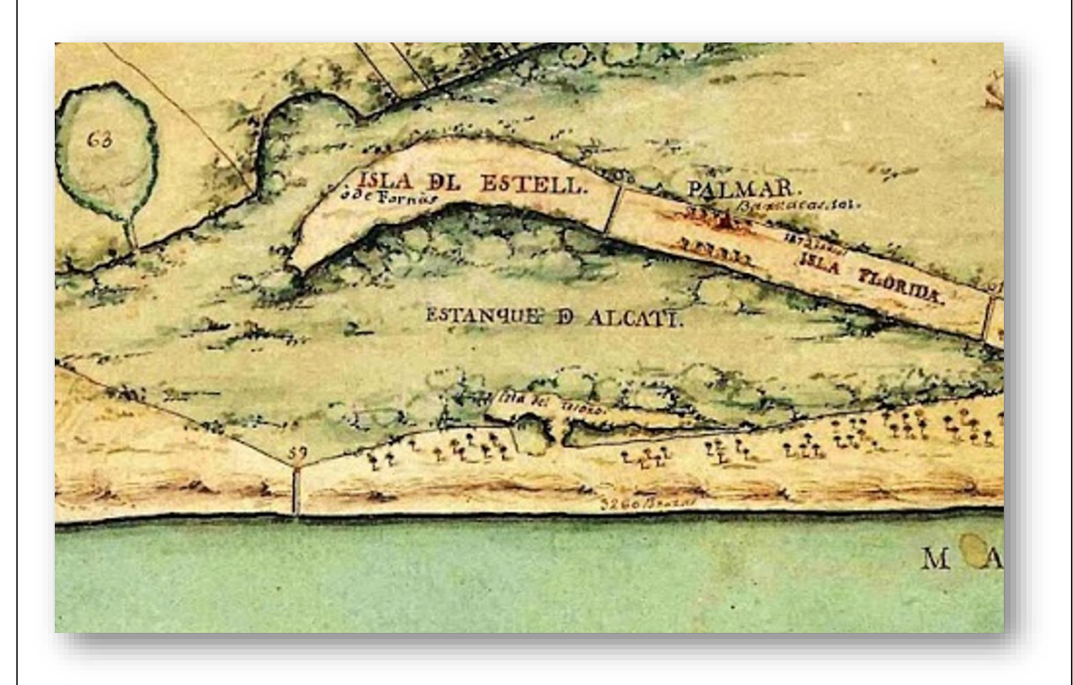
PHOTO 5. In 1751, according to the topographic map of Albufera by Juan Bautista Romero, El Perellonet was a narrow strip of land (restinga) between the Alcatí pond and the sea. The Perelló gola is marked as number 59 on the map.

The Alcatí pond, a large body of water that existed between El Palmar and present-day Perellonet, would later be filled in for rice cultivation. The Perellonet gola did not exist at that time.