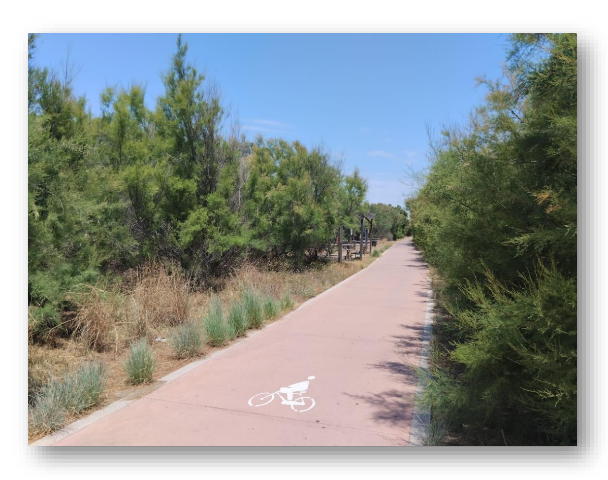
PHOTO 6. Cycling path that connects Pinedo with El Saler along L'Arbre del Gos Beach.