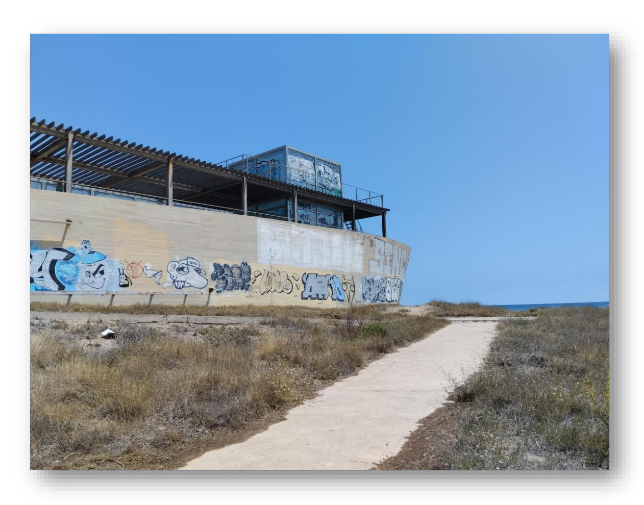
PHOTO 3 and 4. The dockworkers' school building