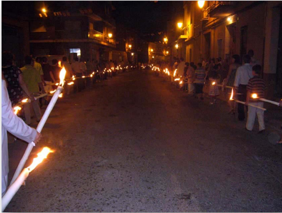
PHOTO 5. Procession of the True Holy Christ with "les atxes"