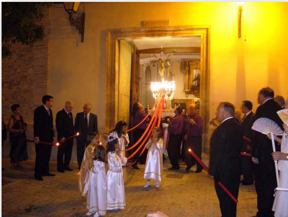
PHOTO 4. Procession of the True Holy Christ with "les atxes"