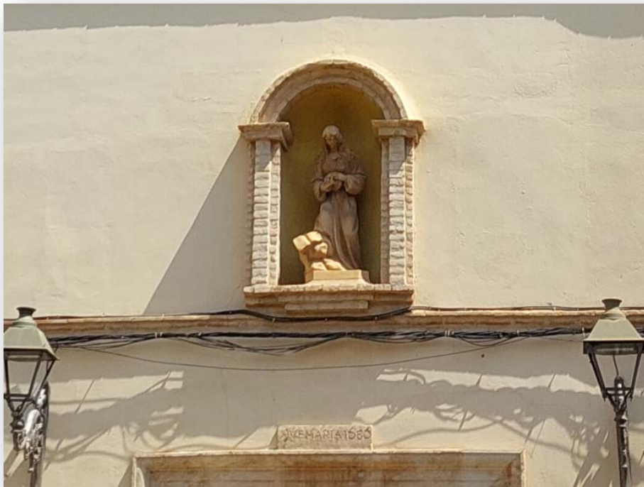
PHOTO 2. Detail of sculpture above the main door