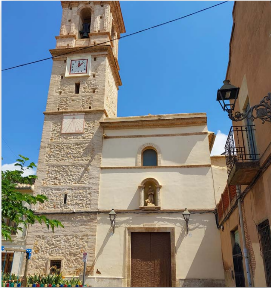
PHOTO 1. Church of Saint Mary Magdalene