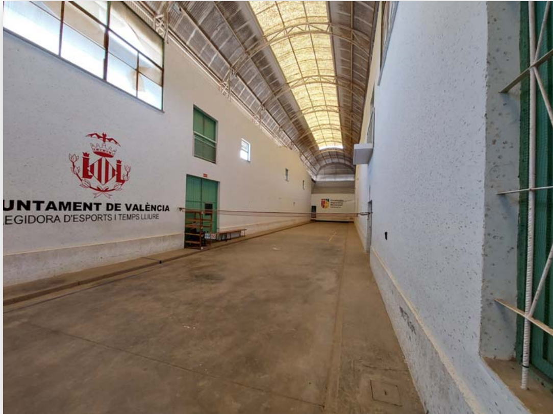
FOTO 1. Borbotó's Pilota Valenciana Trinquet