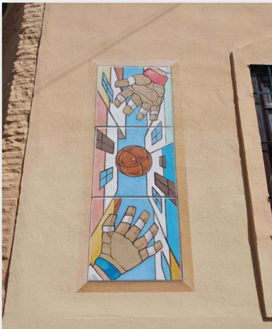
FOTO 3. Painting dedicated to Valencian Pilota, located on the side facade of the former Town Hall of Borbotó (corner of Doctor Constantino Gómez Street with Moreral Square)