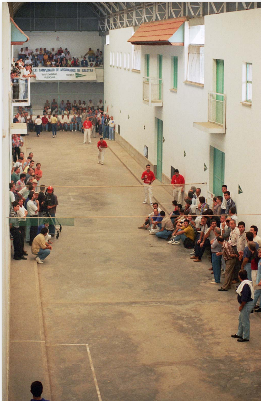
FOTO 2. Valencian Pilota match at Borbotó's Trinquet.