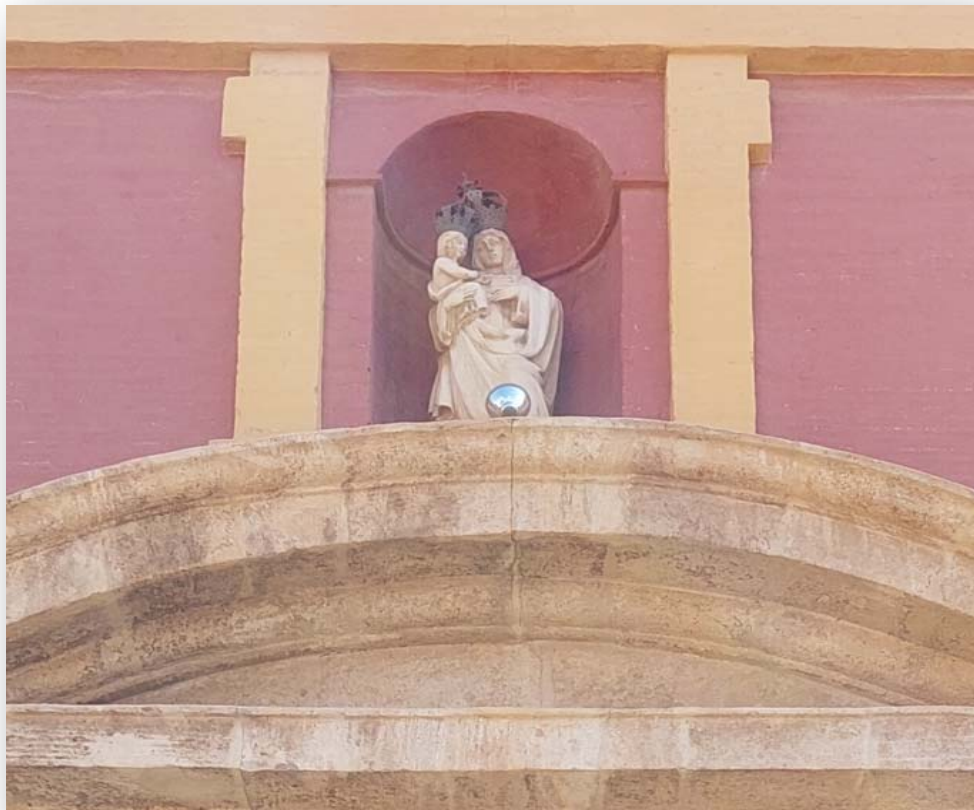
PHOTO 3. Detail of sculpture above the main door