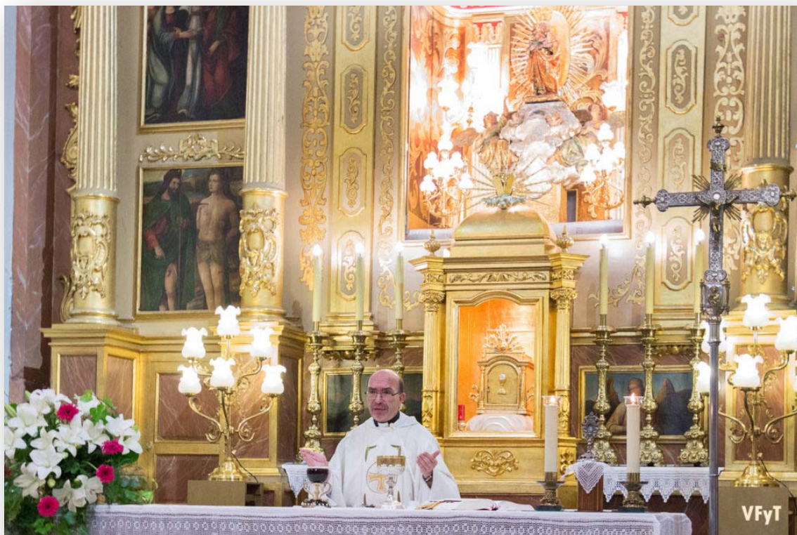
PHOTO 4. Interior of the Church of Santa Ana