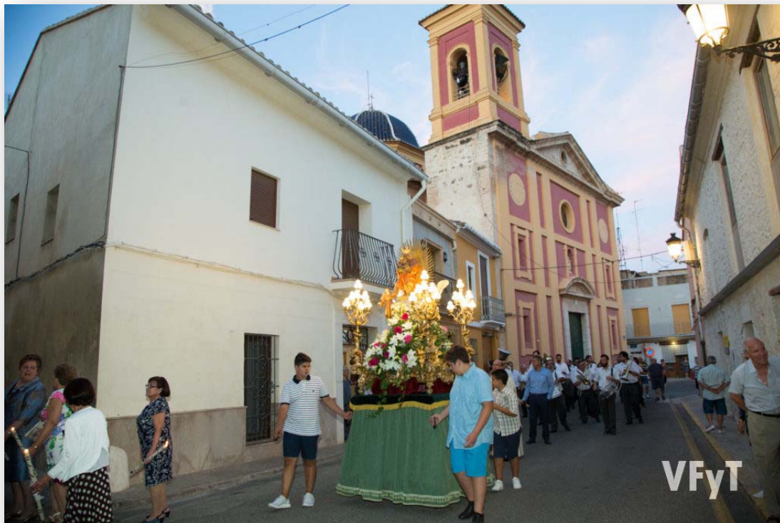
PHOTO 5. Santa Ana celebration in the streets of Borbotó