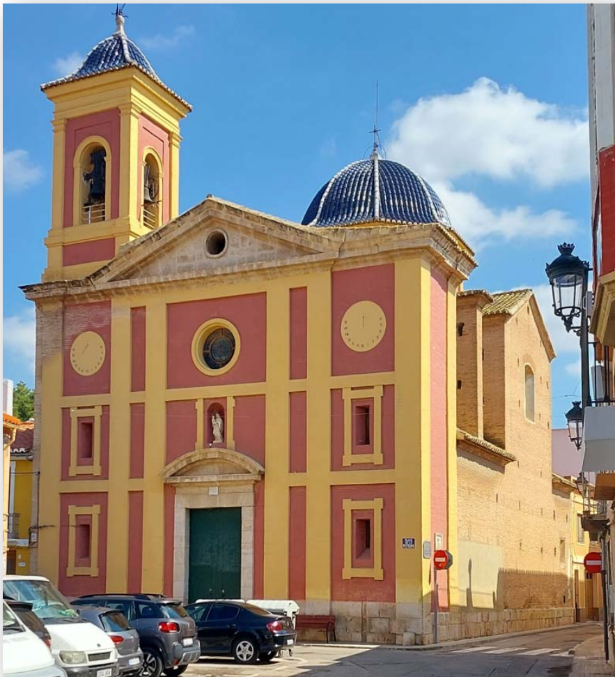
PHOTO 2. Church of Santa Ana