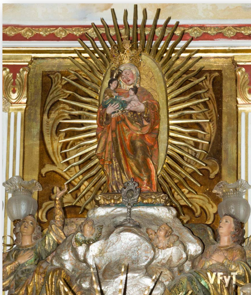
PHOTO 6. Image of Santa Ana in the parish of Borbotó