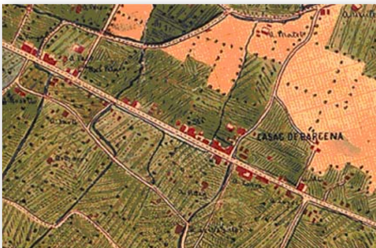
PHOTOS 1 and 2. Maps of Casas de Bàrcena from the years 1821 and 1882. Historical cartography