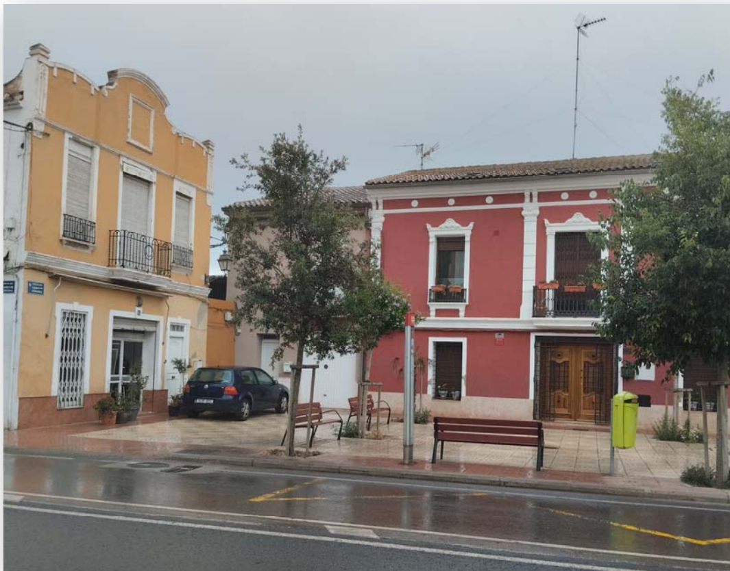
PHOTOS 3 and 4. Placeta of Cases de Bàrcena, identified as the center of the urban centre.