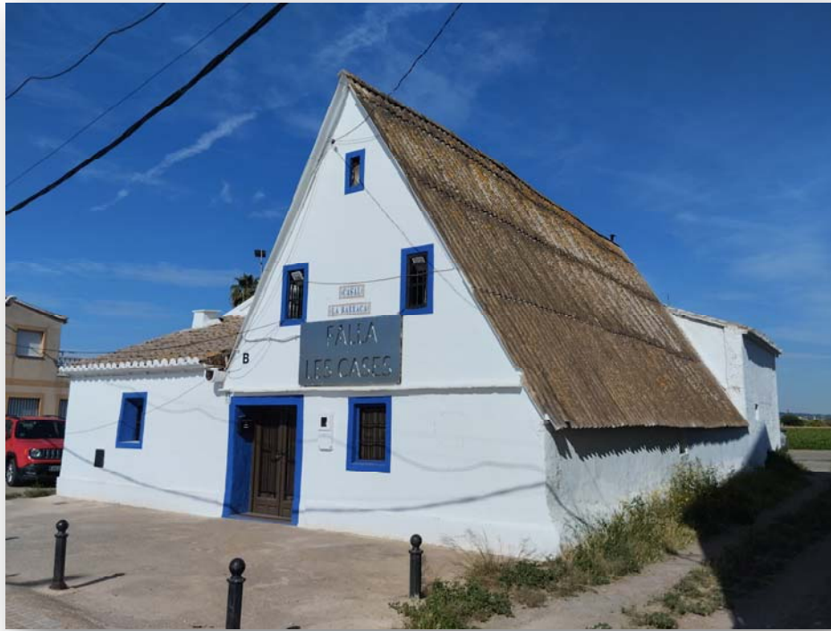
FOTO 7. Barraca de Ceba