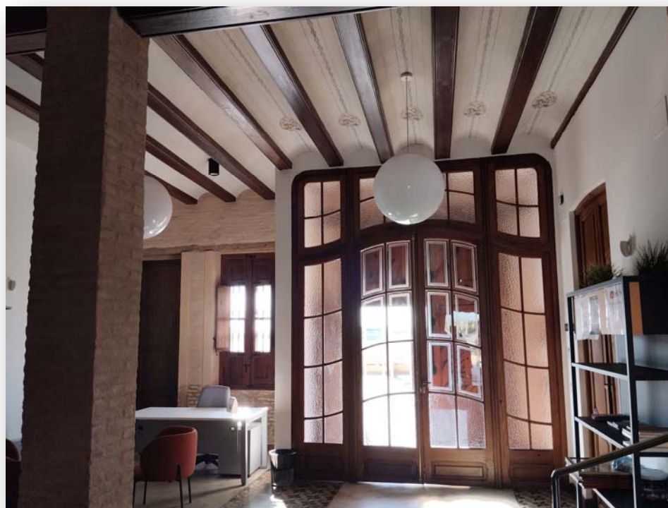
PHOTOS 5 and 6. City Hall of Cases de Bàrcena..