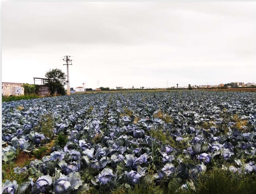
FOTO 8. Rural landscape in Cases de Bàrcena