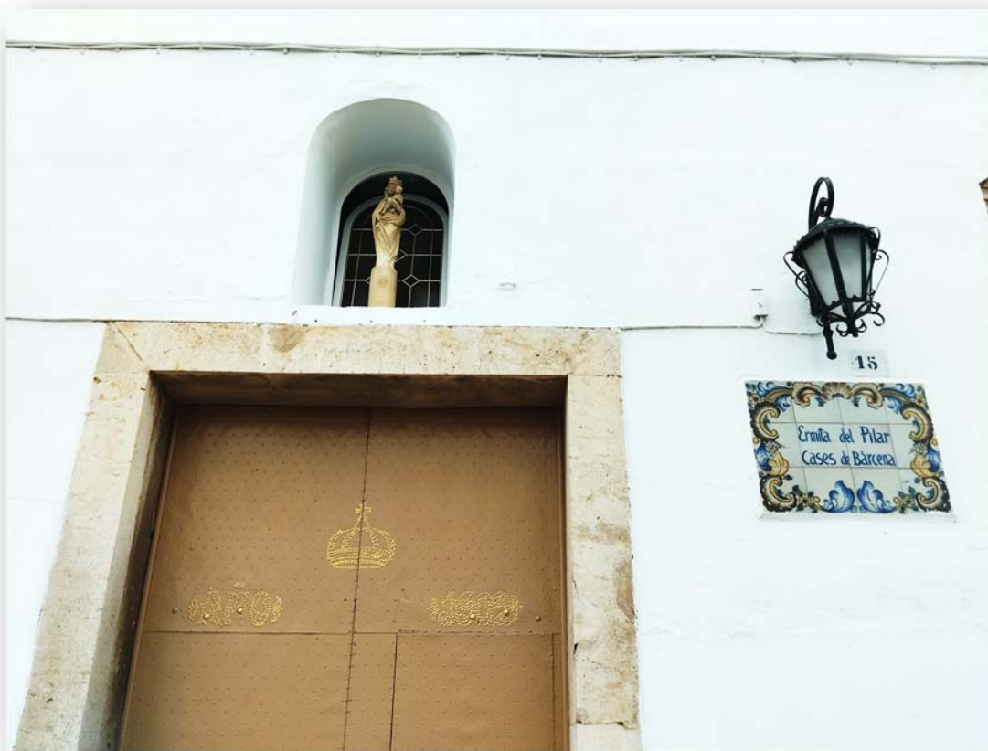
PHOTOS 1 and 2. Pilar Hermitage. Cases de Bàrcena.