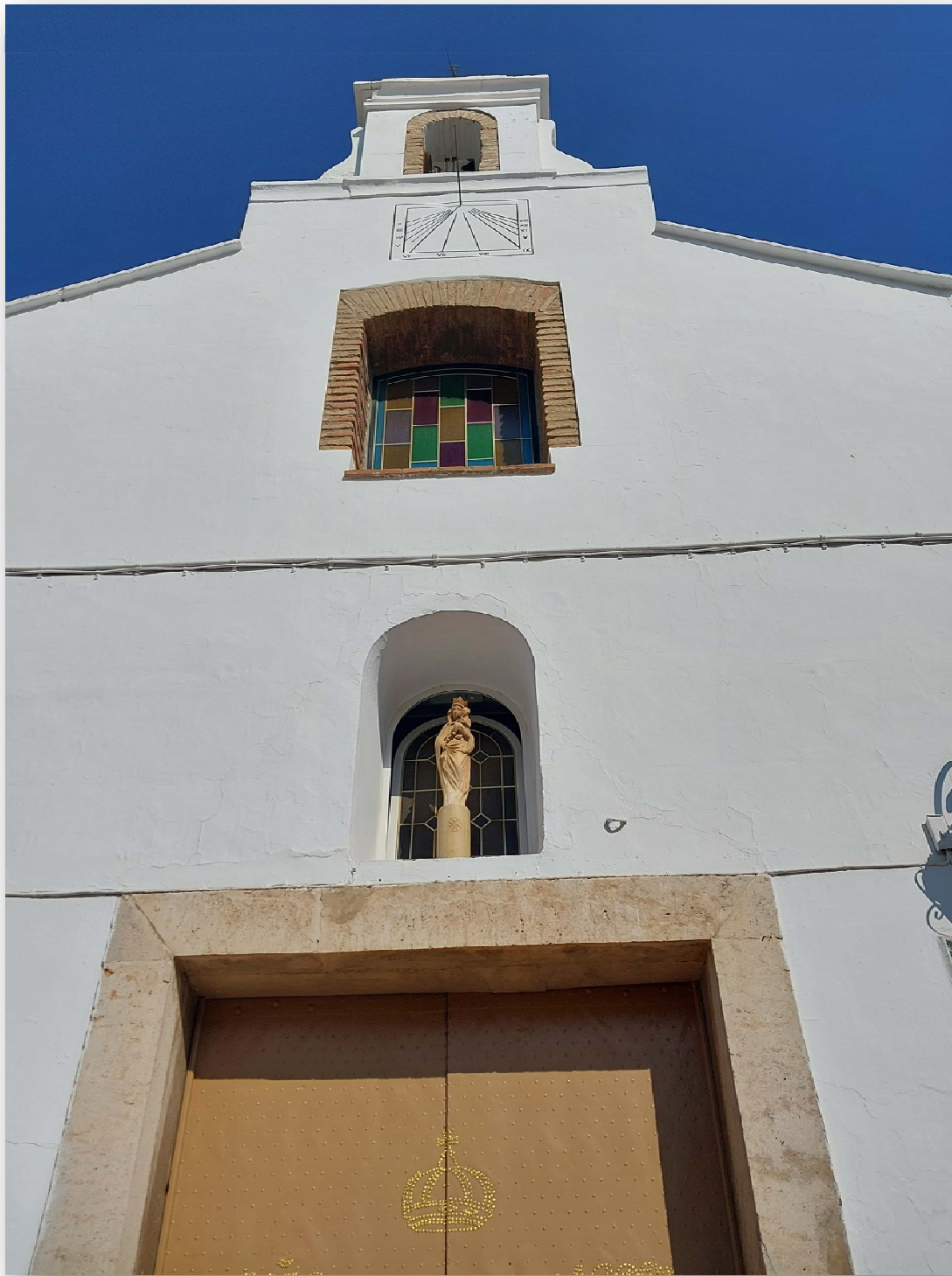
PHOTO 3. Detail of figure, window and sundial.