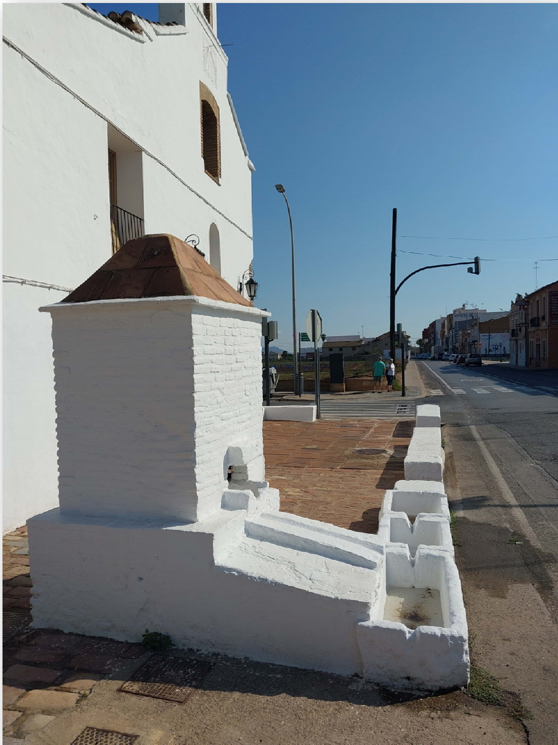
PHOTO 4. Detail of the watering through next to the hermitage.