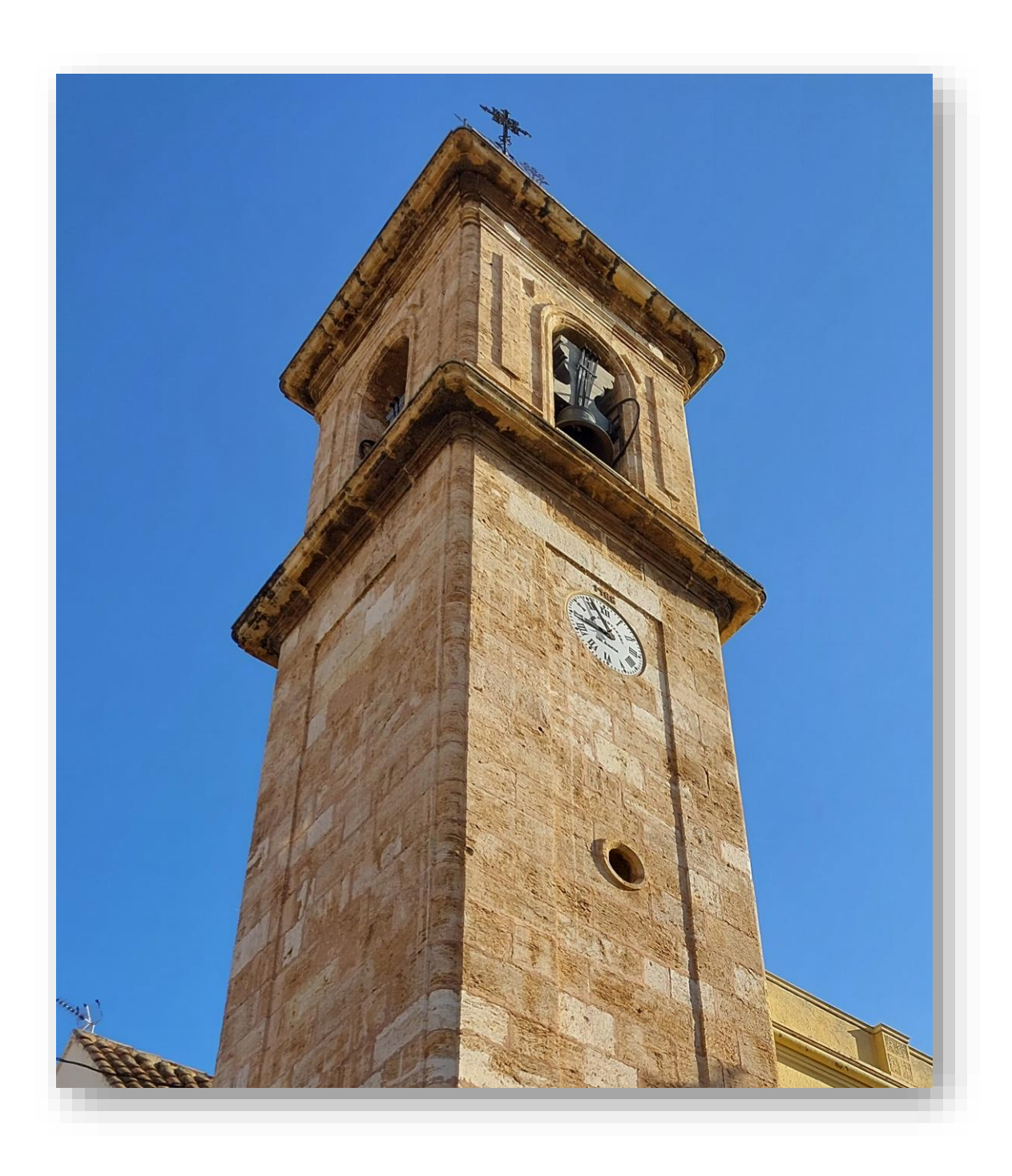
PHOTO 2. Detail of the bell tower of the Church of the Assumption and Saint Barbara, Massarrojos.