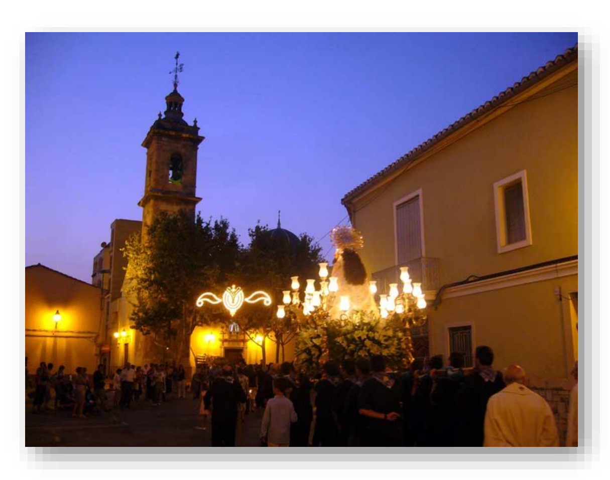
PHOTO 5 and 6. Saints Abdón and Senén and the Virgin of the Forsaken, processing during the festivals of Massarrojos