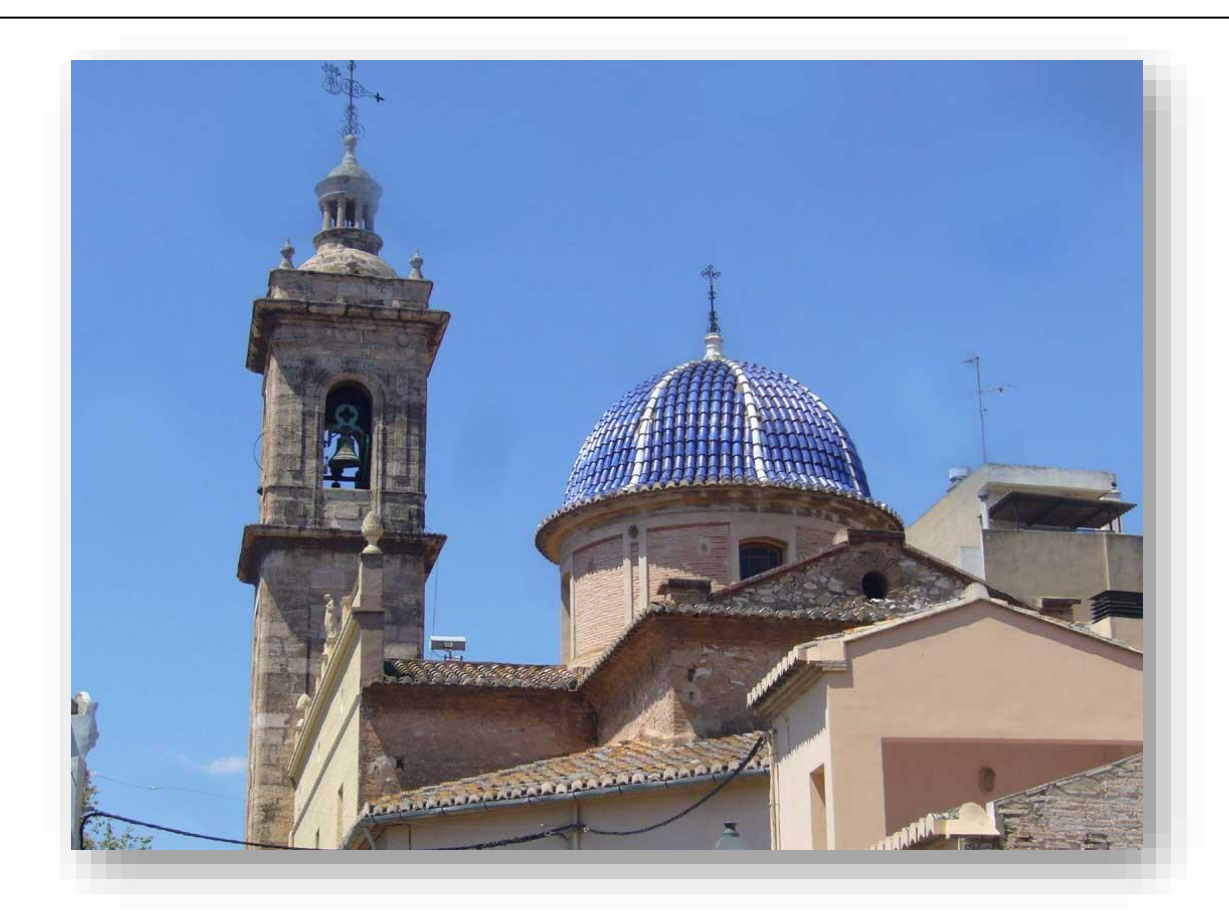
PHOTO 3. Bell tower and dome of the Church of the Assumption and Saint Barbara, Massarrojos