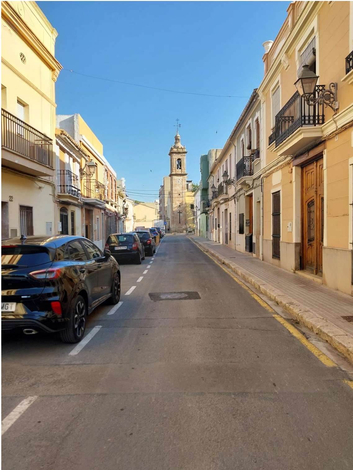
PHOTO 5. Carrer de Baix de Massarrojos, lined with houses in traditional Valencian style.