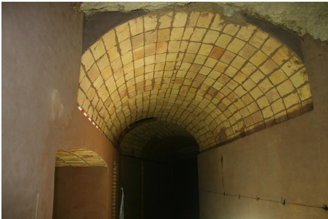
PHOTOS 3 and 4. Underground shelter of Massarrojos.