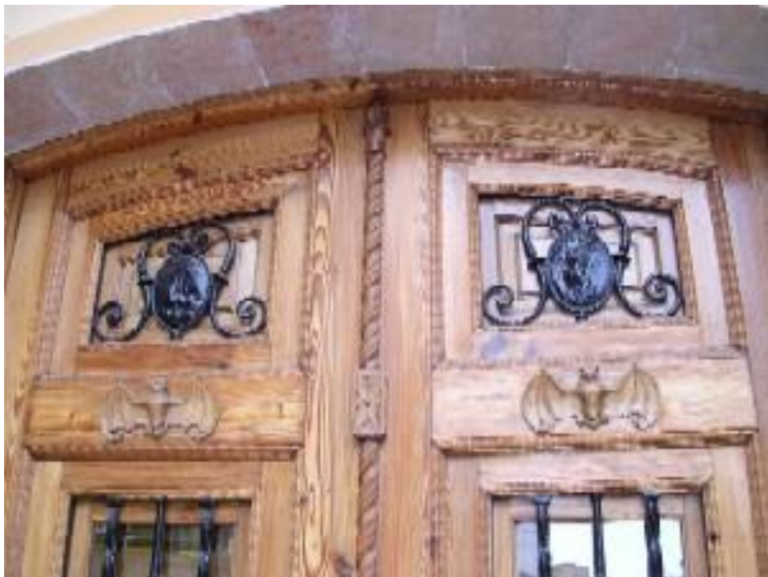
PHOTO 6 and 7. Nicolau Primitiu's house in Plaza del Soñador. Detail of the bats (rats penats) on the entrance door of Nicolau Primitiu's house.