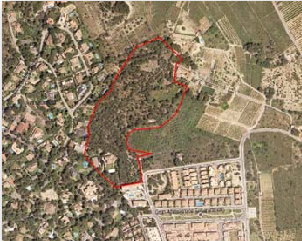
PHOTO 1. Quarry location. Aerial photograph from SIGESPA, year 2007."