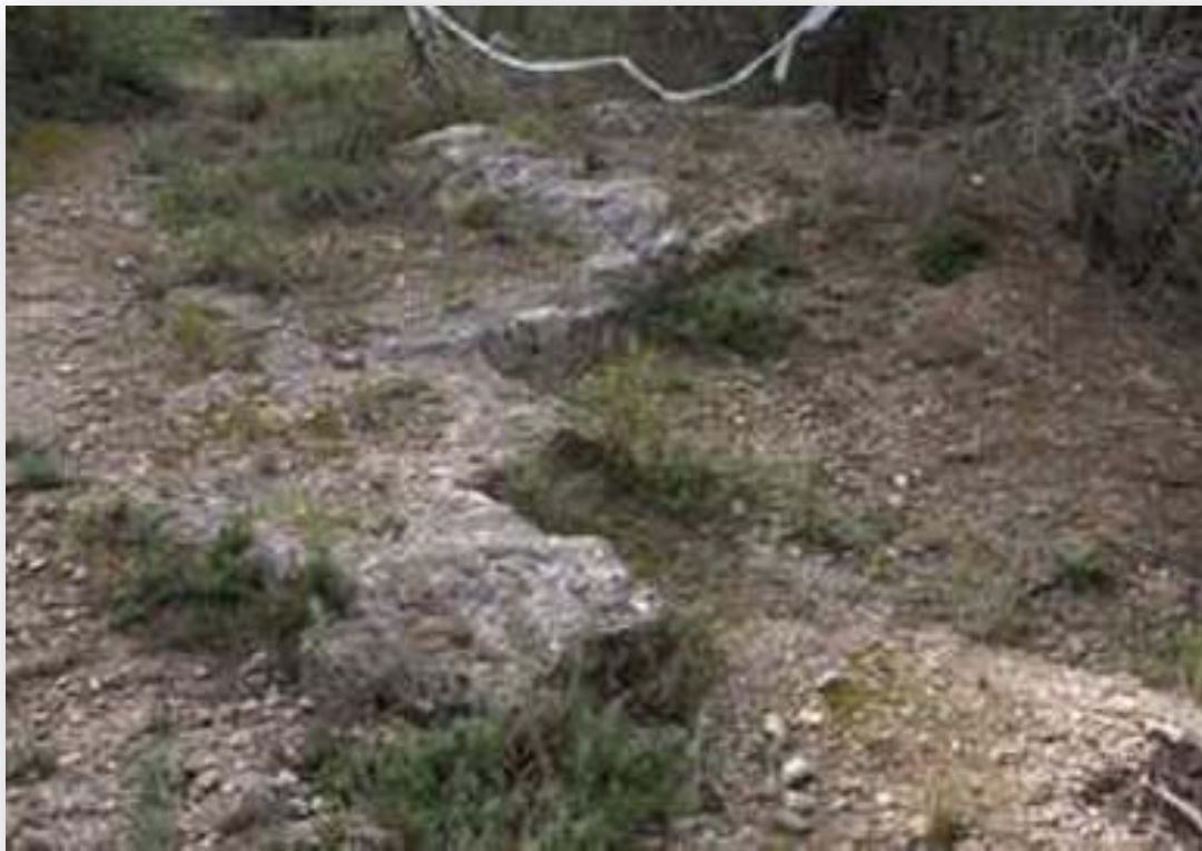
PHOTO 2. Quarry extraction face ( Catálogo de bienes y espacios protegidos PGOU València )