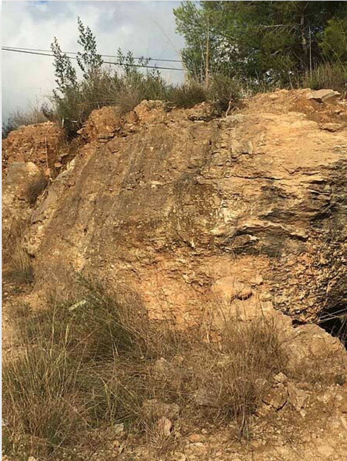
PHOTO 4. Les Dos Llometes Quarry