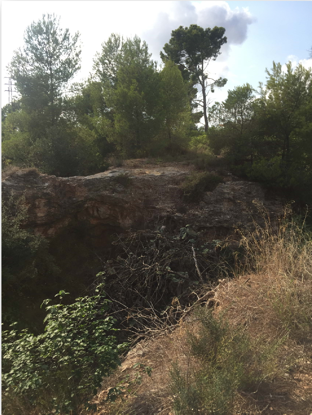
PHOTO 5. Les Dos Lloletes Quarry