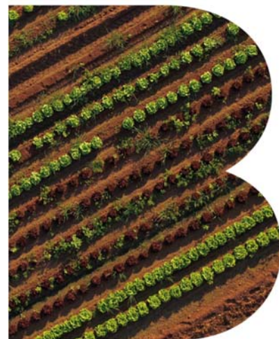
LOCATION OF THE TOURIST ATTRACTION