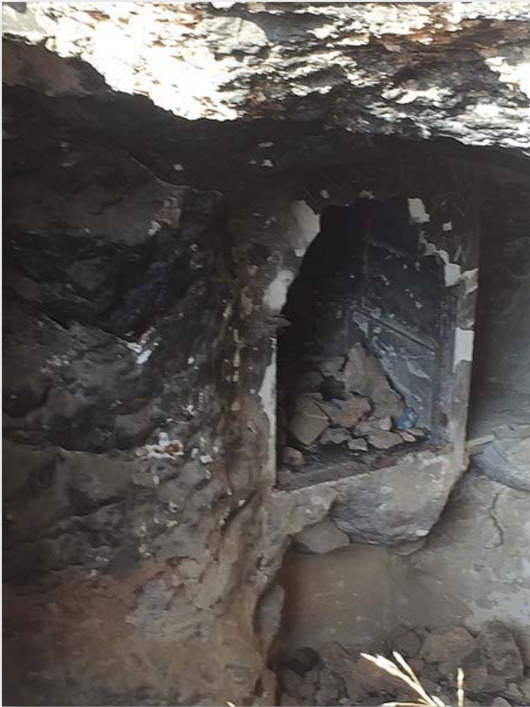
PHOTO 3. Les Dos Llometes Quarry