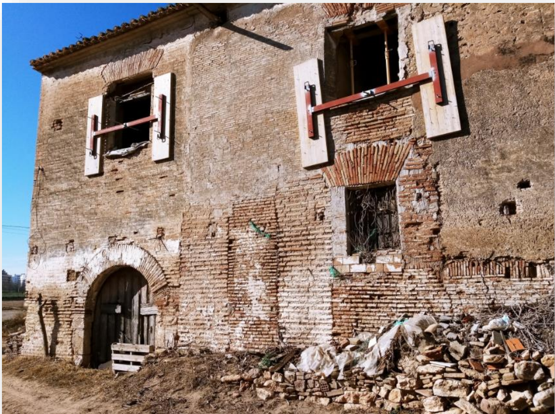
PHOTO 4. Tallarròs Farmhouse