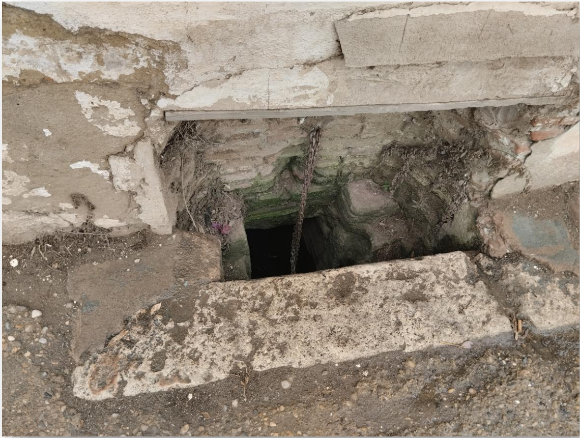
PHOTO 3. Detail of the hydraulic system of the Molí dels Alters