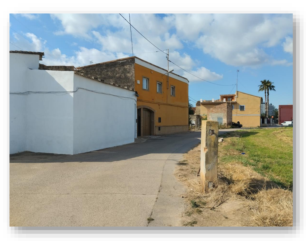
PHOTO 5 and 6. Landscape of orchards and farmhouses near Alquería Fonda