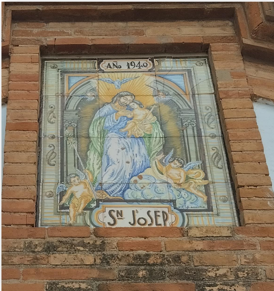
PHOTO 5. Detail of the ceramic altarpiece dedicated to Saint Joseph