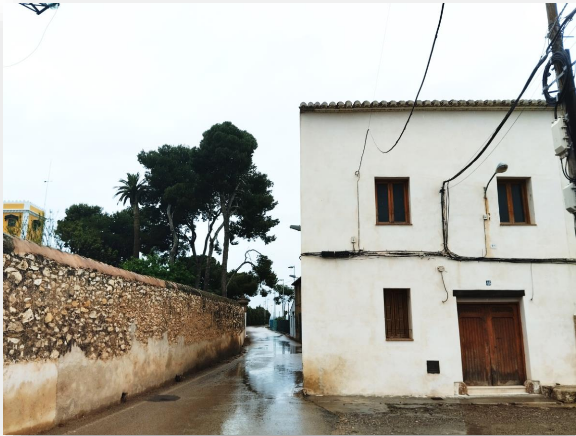
PHOTO 8. The old road to Godella between the two farmhouses