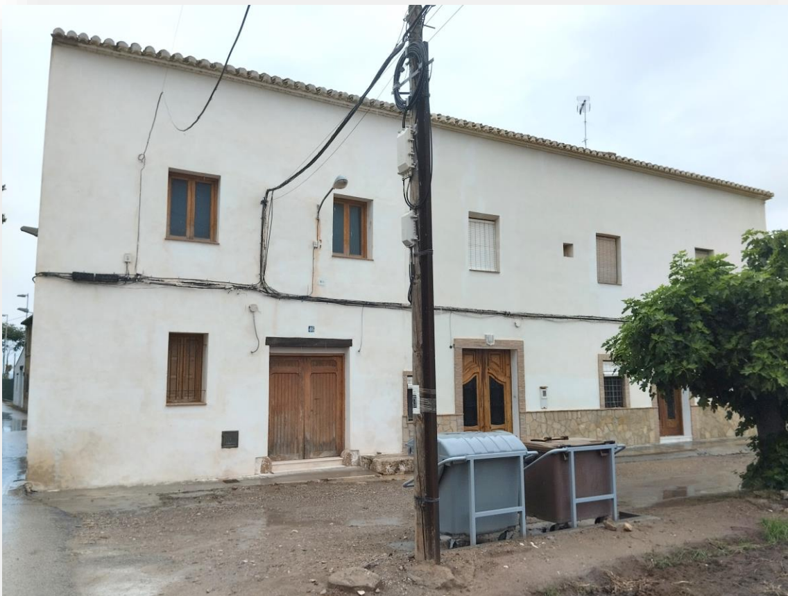
PHOTO 6 and 7. Pi farmhouse with its bell gable