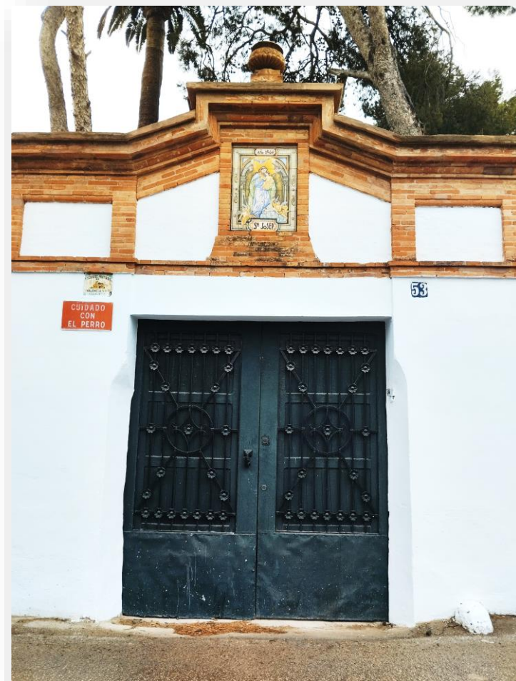
PHOTO 3 and 4. Access to Nova de Sant Josep farmhouse. At the entrance from the old road to Godella, there is a ceramic altarpiece from 1940.